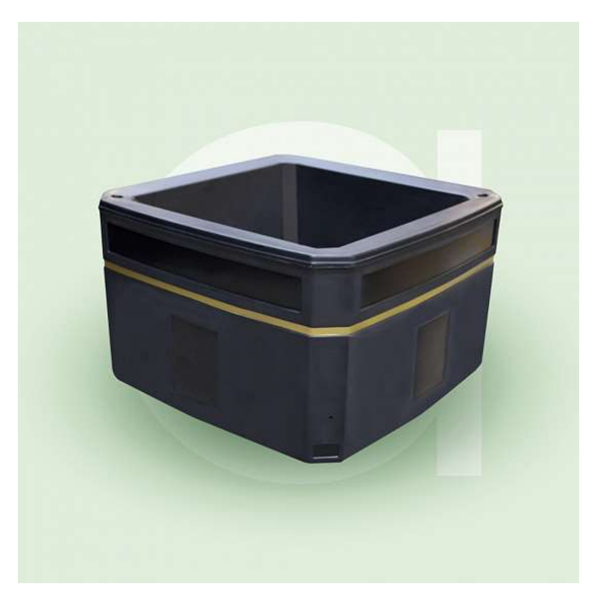
Metre Square Planter (MSP-0P) Cost £323 Supplier Amberol Size 1040mm Compost 490L